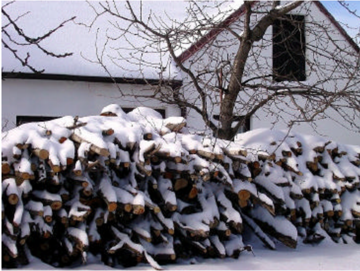
Fire wood may contain pest beetles